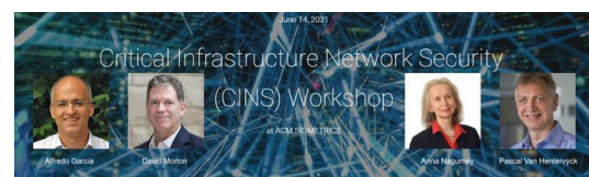
Keynote Speakers at the ACM Workshop

The Center Director will be a keynote speaker at the ACM Workshop on Critical Infrastructure Network Security in June 2021.