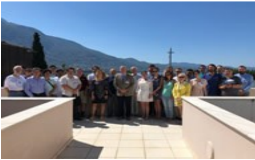
Dynamics of Disasters conferees, July 2019