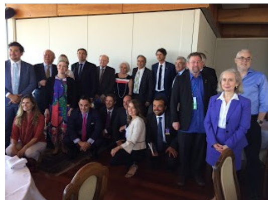
Group photo of speakers with 8 Latin American ambassadors at lunch after Congreso Futuro Valparaiso