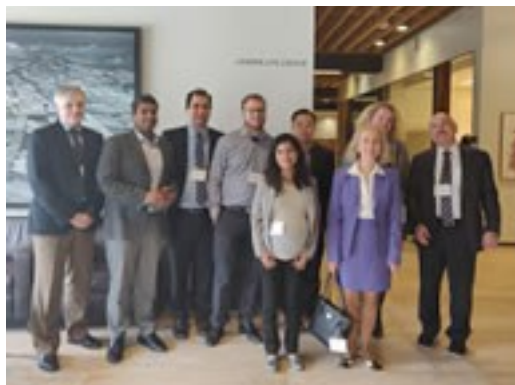
Smart Cities Analytics Workshop, Ivey School