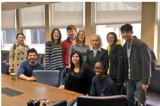
The Center Director with doctoral students in Industrial and Operations Engineering at the University of Michigan

On October 5, 2018, the Center Director delivered a seminar on Game Theory Network Models for Disaster Relief at the University of Michigan in Ann Arbor. She very much enjoyed seeing colleagues there and meeting with doctoral students.