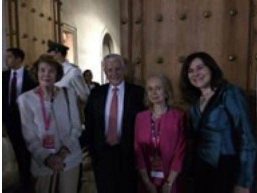
With other speakers at the Congreso Futuro after the banquet at the Presidential Palace in Santiago, Chile