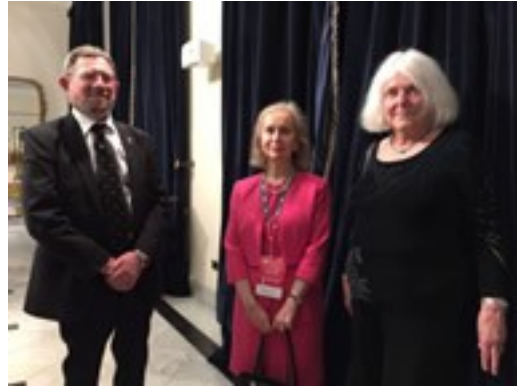
The Center Director with Nobel laureate Dr. Michael Kosterlitz and his wife at the Presidential Palace in Santiago, Chile

Science: A Personal Journey and the video can be accessed here (with Spanish translation) .