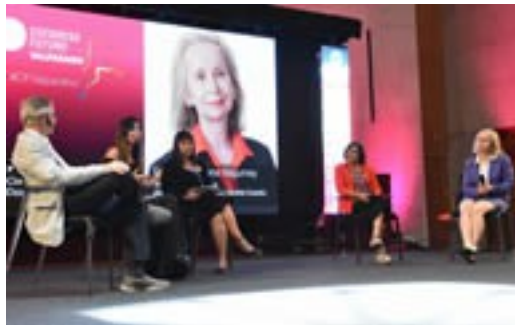
The panel at Congreso Futuro in Valparaiso, Chile after the Center Director's talk on Women in Science: A Personal Journey