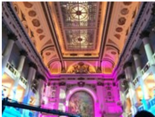
The stunning venue of the Congreso Futuro in Santiago, Chile