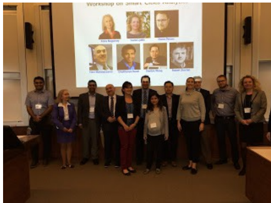
Group photo after the Smart Cities Analytics Workshop

The format of the workshop, with 45 minute presentations, allowed for deep and very stimulating discussions.