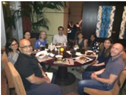
Center Associates get together for a dinner hosted by the Center Director at INFORMS Phoenix