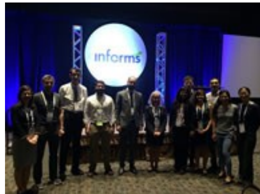
Photo taken after the Omega Rho Lecture at INFORMS Phoenix

She was especially delighted to see several Center Associates in the audience of about 2,000 and many wonderful colleagues!