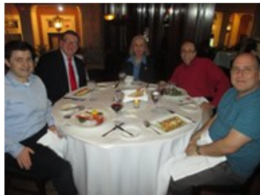
Enjoying dinner after the presentation in New Haven