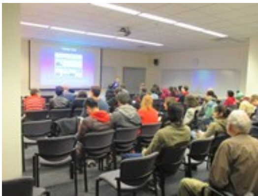
The Center Director delivering her Game Theory and Cybercrime lecture

On December 2, 2015, the Center Director gave an invited talk on Game Theory and Cybercrime at the UMass Departments of Computer Science and Electrical and Computer Engineering Cyber Security Faculty Lecture Series.