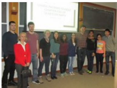
UMass Amherst INFORMS Student Chapter End of the Semester Party, December 14, 2015