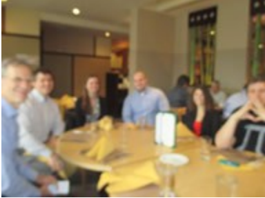
Enjoying the lunch before the presentation