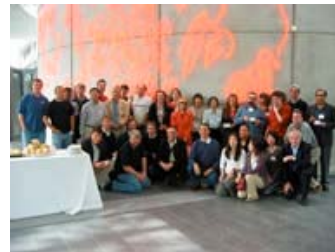
Group Photo of the Auckland Workshop Participants