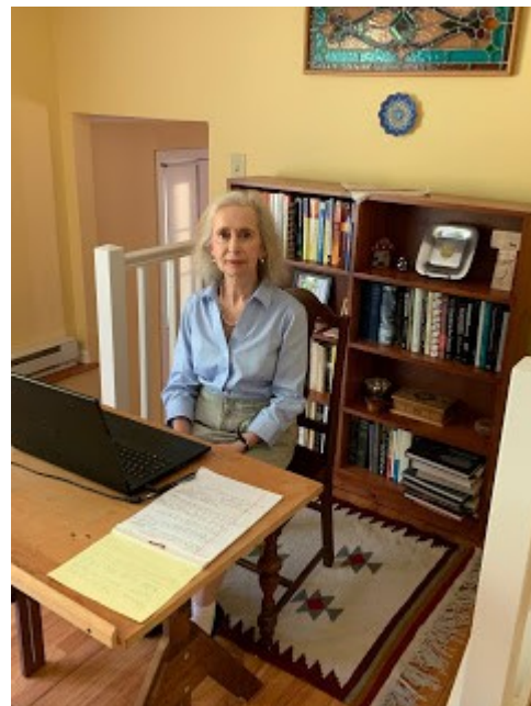
The Center Director before her INFORMS webinar

The slides in her webinar have been posted.