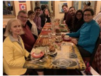
Celebration dinner at Judie's