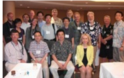
Invited Speakers at the Social Theory and Social Computing Workshop in Hawaii