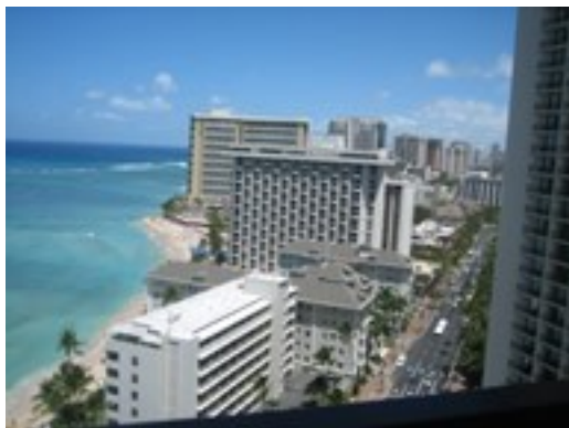
The conference hotel venue