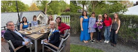
Photos at the Dinner