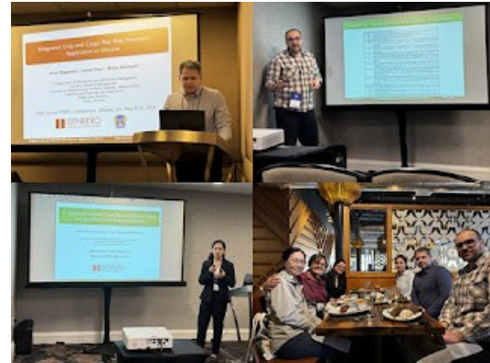
This summer will be busy in terms of conferences. The Center Director will present 3 invited talks at the EURO Conference in Leeds, UK. This will be a very special conference since the professional society of EURO is marking its 50 th anniversary.