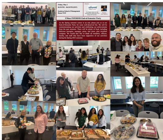
Collage of Photos from the End of the Semester UMass Amherst INFORMS Student Chapter Party

Contents – Copyright 2025-© - University of Massachusetts Amherst