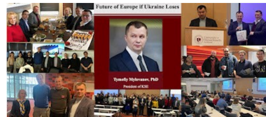
Collage of Photos from the Visit of the KSE President