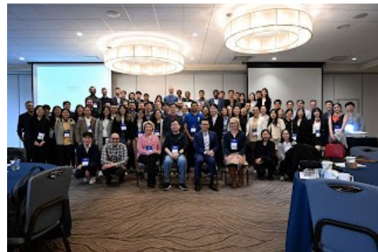
The POMS Doctoral Colloquium in Minneapolis