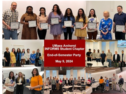
A Collage of Photos from the UMass Amherst INFORMS Student Chapter Party

Service as a Chapter Officer builds many skills, including leadership. And, for those students (many of the members are PhD students) who enter academia after receiving their doctorates, service activities are important, along with excelling at research and teaching. Universities run on those three "pillars."