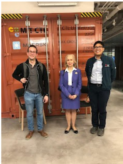
At MIT at the Center for Transportation and Logistics