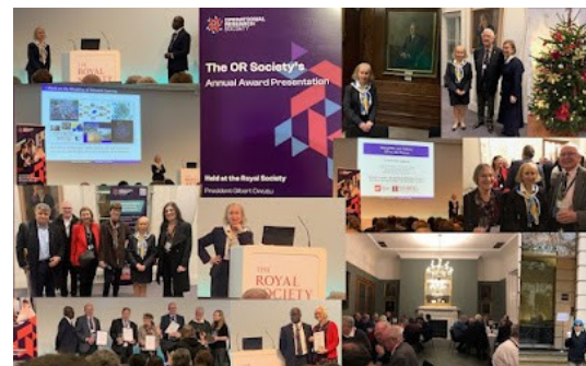
Photos from the Blackett Lecture event

On December 5, 2024, the Center Director had the incredible honor of delivering the Blackett Lecture at The Royal Society in London, England. She was invited to speak by The Operational Research (OR) Society. This lecture is very prestigious. The title of her Blackett Lecture was: NetWORKs and Policies: OR to the Rescue.