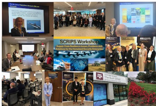
Photos from the SCRIPS Workshop in DC

There were 3 themes to this workshop: the agricultural and food industry, the semiconductor industry, and ports. The organizers were incredibly prescient with the workshop taking place October 1 and 2, 2024, and the East Coast and Gulf Coast dock workers set to go on strike at midnight on October 1!