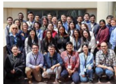
Group photo of the FutureBAProf Workshop Participants