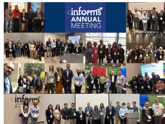
Photos from the INFORMS Seattle Conference