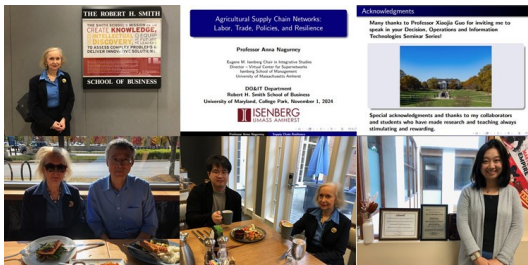
The Center Director Speaks at the Smith School at the University of Maryland on November 1, 2024.