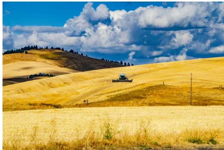
Harvesting wheat in Washington state.

As the war in Ukraine trudges on and Americans fret over the rising cost of their favorite breakfast cereals, there may be a group that benefits from the chaos and the increasing price of grain : U.S. farmers.