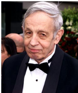
The Nobel Laureate John F. Nash

Nash (1950, 1951) subsequently generalized Cournot's concept of an equilibrium for a behavioral model consisting of n agents or players, each acting in his/her own self-interest, which has come to be called a noncooperative game.