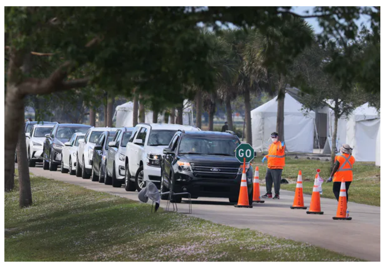
In Davie, Fla., Department of Health workers direct cars at a drive-thru vaccination site.

Finally, without health care workers to administer the COVID-19 vaccines, the battle against the coronavirus cannot be won. And many hospitals are already short-staffed because of the pandemic.