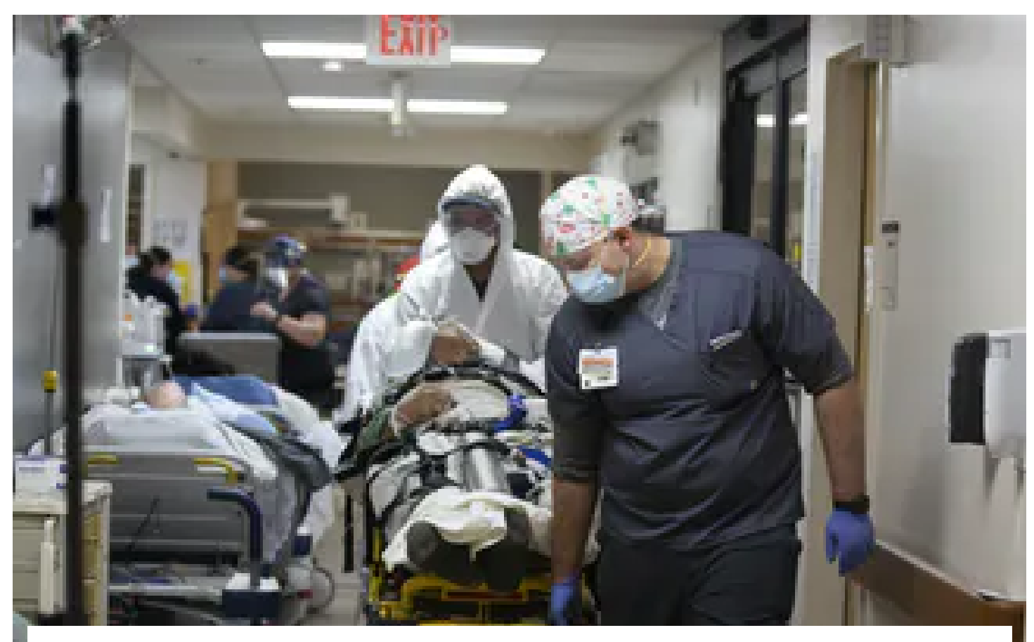
COVID-19 crisis in Los Angeles: Why activating 'crisis standards of care' is crucial for overwhelmed hospitals