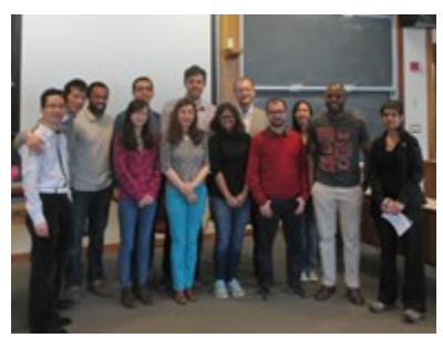
The panelists with some of the audience members

The discussions with the panelists continued long after the panel!