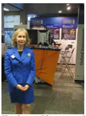
The Center Director at the DPG conference in Berlin

In her presentation, she gave an overview of some of the applications of supply chains that she has investigated with Center Associates from electric power ones to food supply chains and then focused on the work described in a paper of hers just published, with the same title as her talk, in Environment & Planning B (2015), 42(1) , 40-57.