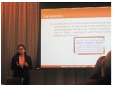
Shivani Shukla presenting at POMS

http://supernet.isenberg.umass.edu/visuals.htm